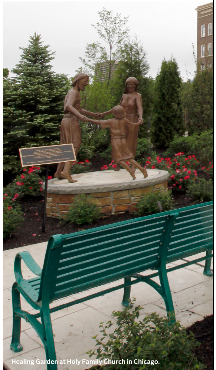
Healing Garden at Holy Family Church in Chicago.

Office for Assistance Ministry (OAM) personnel reach out and extend supportive services to victims-survivors from the moment they come forward with an allegation of clergy sexual abuse. This includes traveling throughout the country