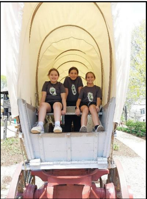
Fourth grade field trip to Naper Settlement