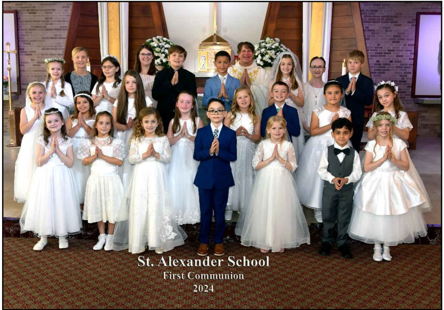
St. Alexander School First Communion 2024