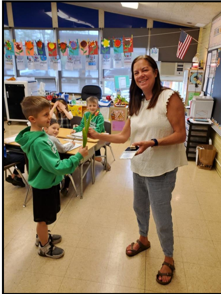
National Teacher Appreciation Week