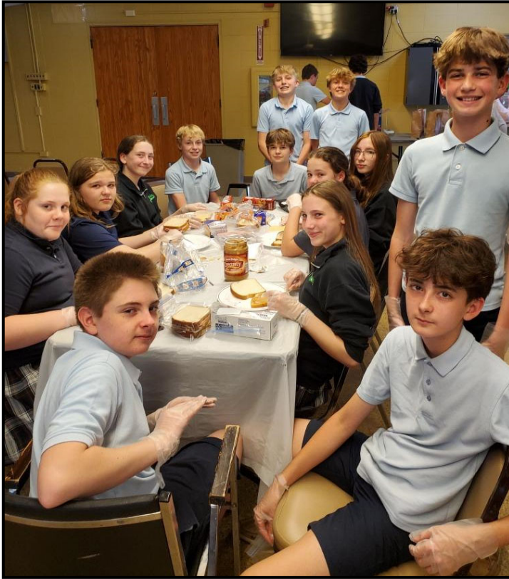
Seventh grade students worked on a Service Project to benefit Lower Wacker Lunches. The students made 140 sandwiches and filled lunch bags with other nutritional items.