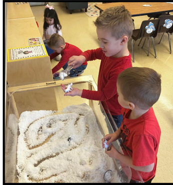
PreK3 exploring winter themed centers