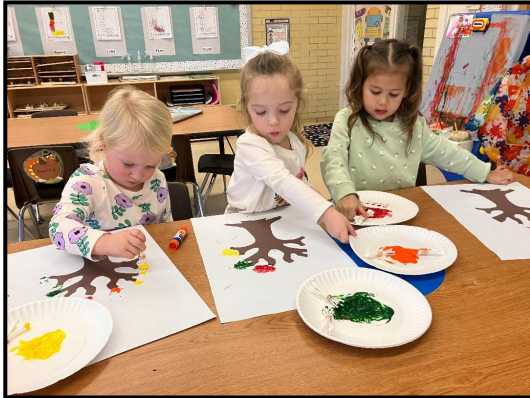
Fall in the PreK 3 room