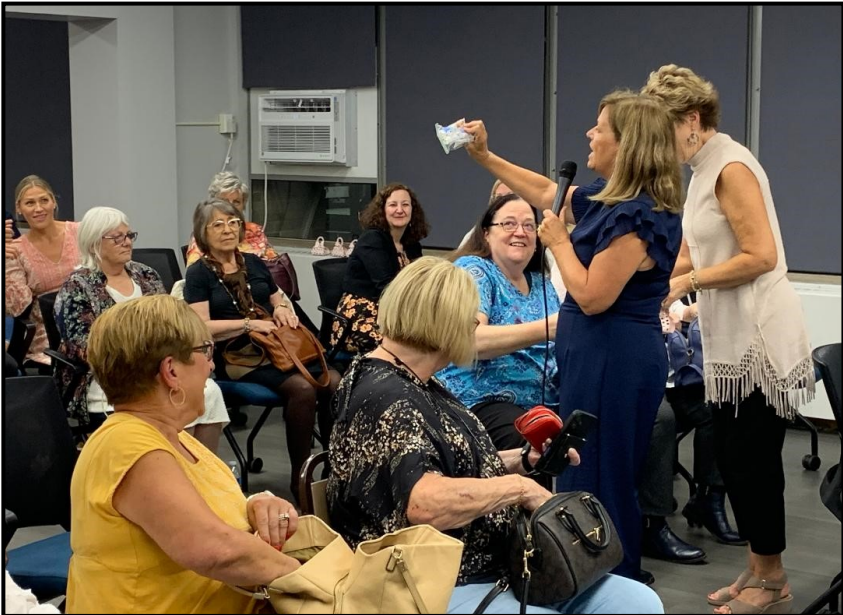
PURSE-ONALITY EVENT What a great turnout!