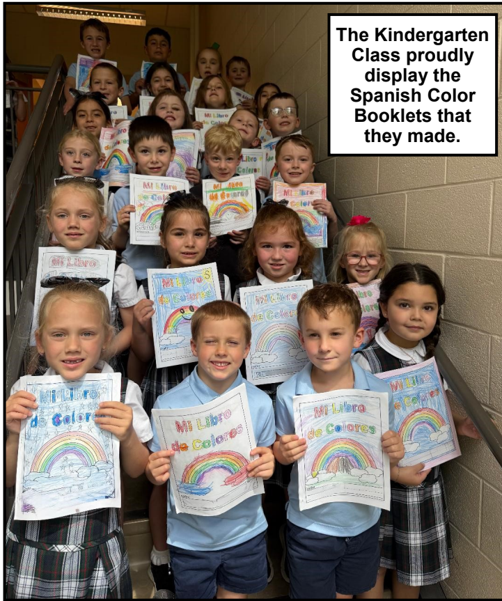
The Kindergarten Class proudly display the Spanish Color Booklets that they made.