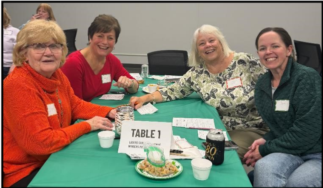
◆ ◆ ◆ ◆ BUNCO NIGHT! ◆ ◆ ◆ ◆